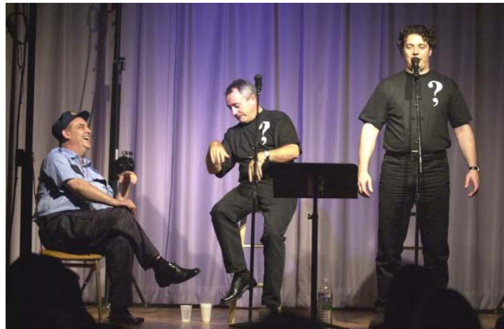
© 2000 Miodrag M. Cirkovic, Index Radio Theater , Cambridge, MA, 5/26/00

Serbian-American Alliance of New England is a Massachusetts incorporated non-profit organization with a federal tax exempt status 501(c)3. SANE is a registered public charity.